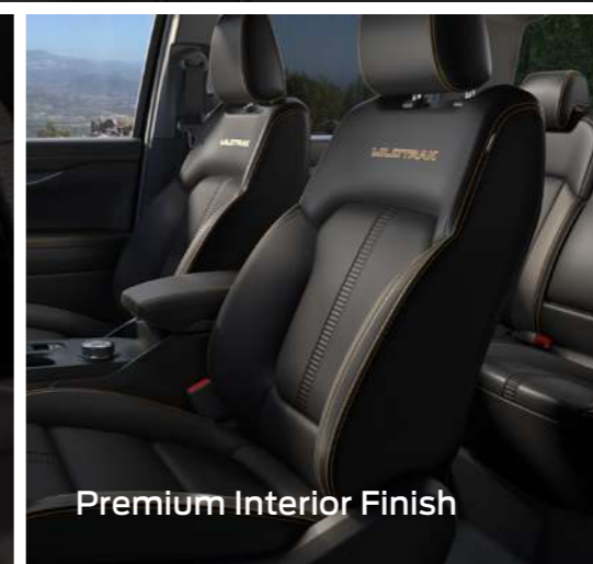
Premium Interior Finish