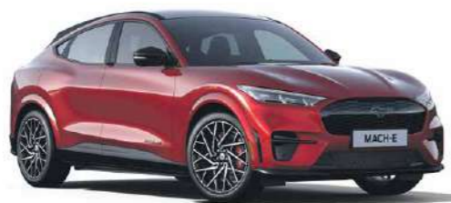
Rapid Red 2