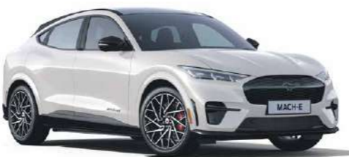
Star White 1